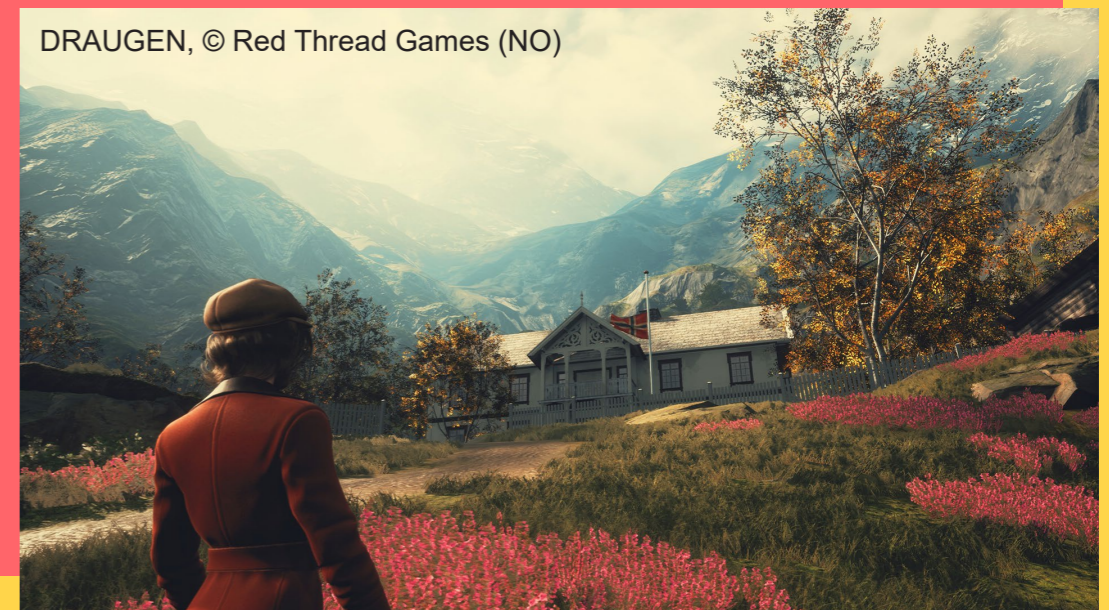
DRAUGEN, © Red Thread Games (NO)