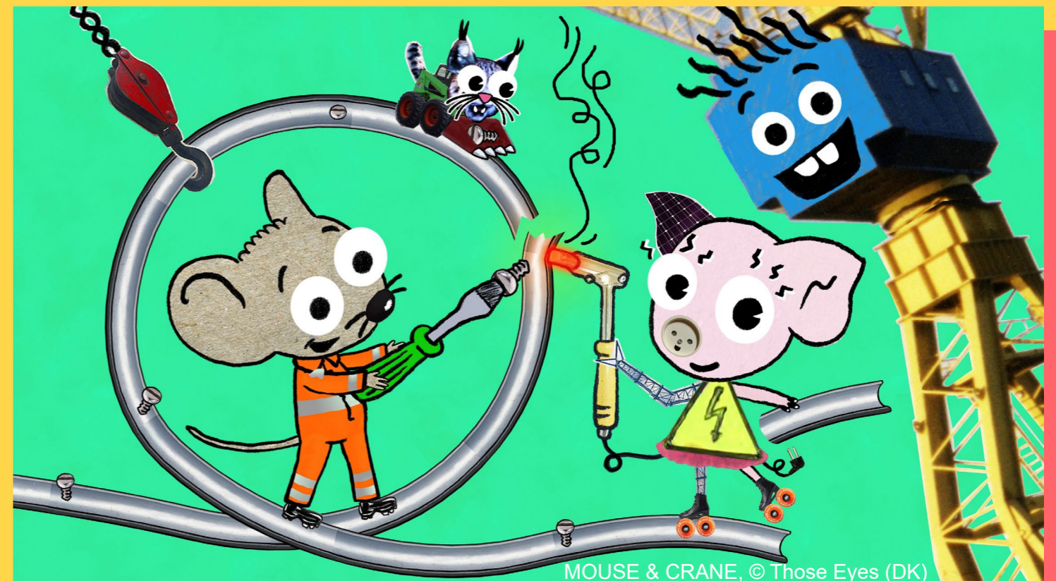
MOUSE & CRANE, © Those Eyes (DK)