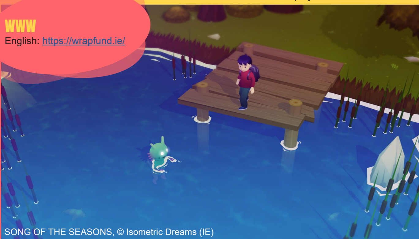
SONG OF THE SEASONS, © Isometric Dreams (IE)