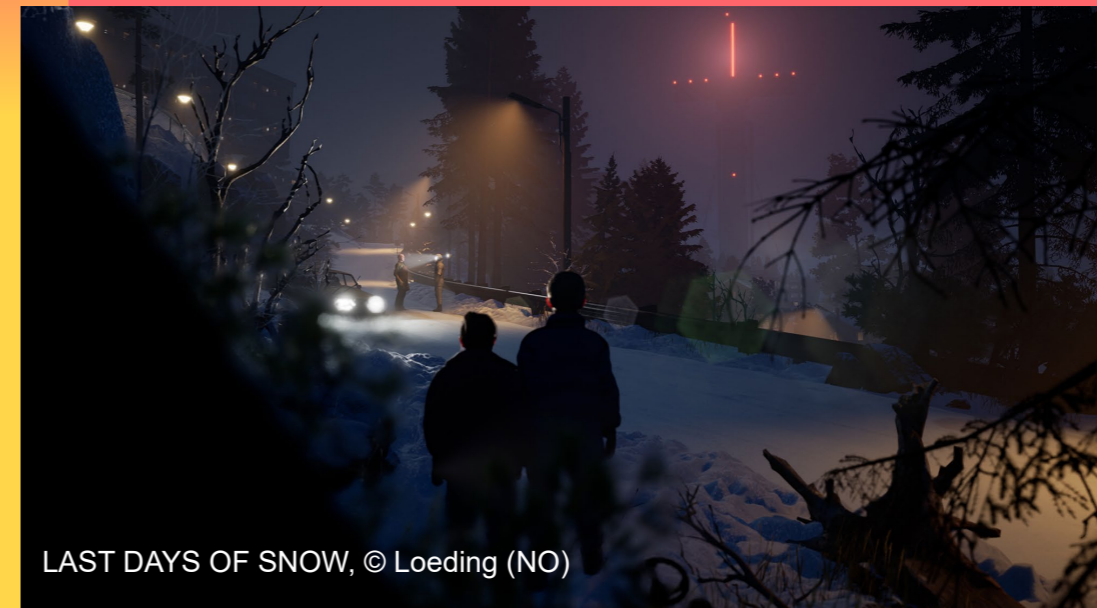
LAST DAYS OF SNOW