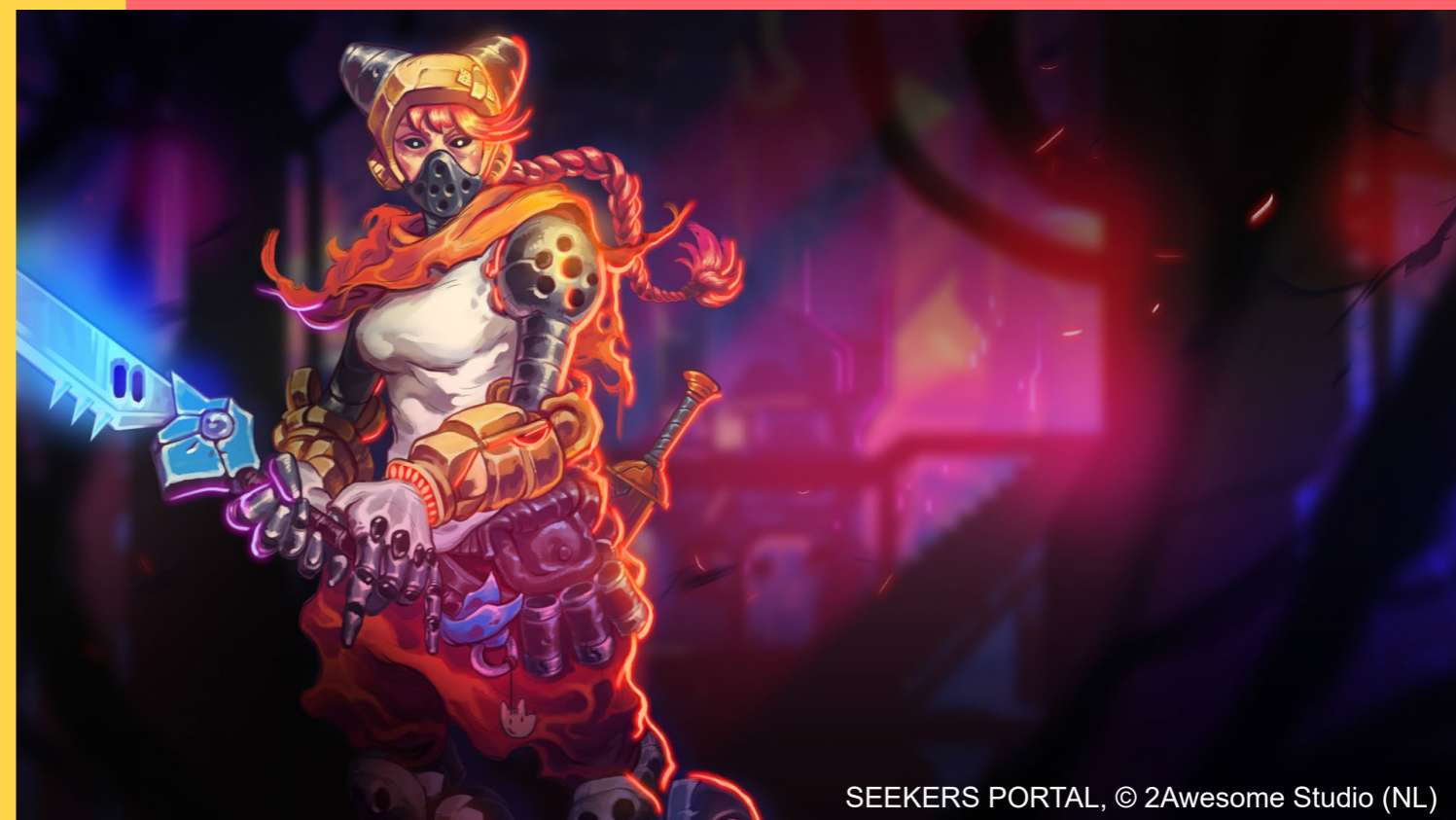
SEEKERS PORTAL, © 2Awesome Studio (NL)

English: https://stimuleringsfonds.nl/en/grants/digital_culture_grant_scheme/