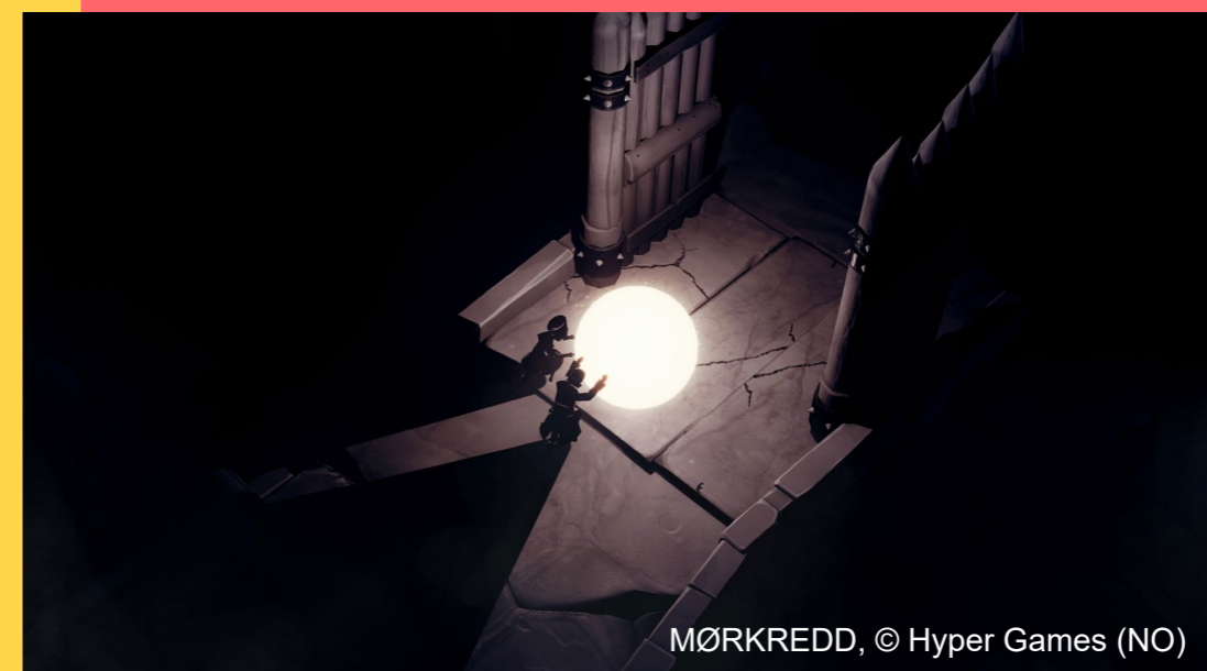
MØRKREDD, © Hyper Games (NO)