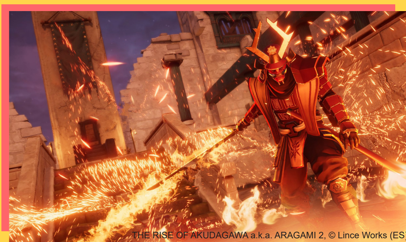
THE RISE OF AKUDAGAWA a.k.a. ARAGAMI 2

Catalan: https://icec.gencat.cat/ca/tramits/tramits-temes/Ajuts-a-projectes-en-lambit-dels-videojocs-i-el-multimedia