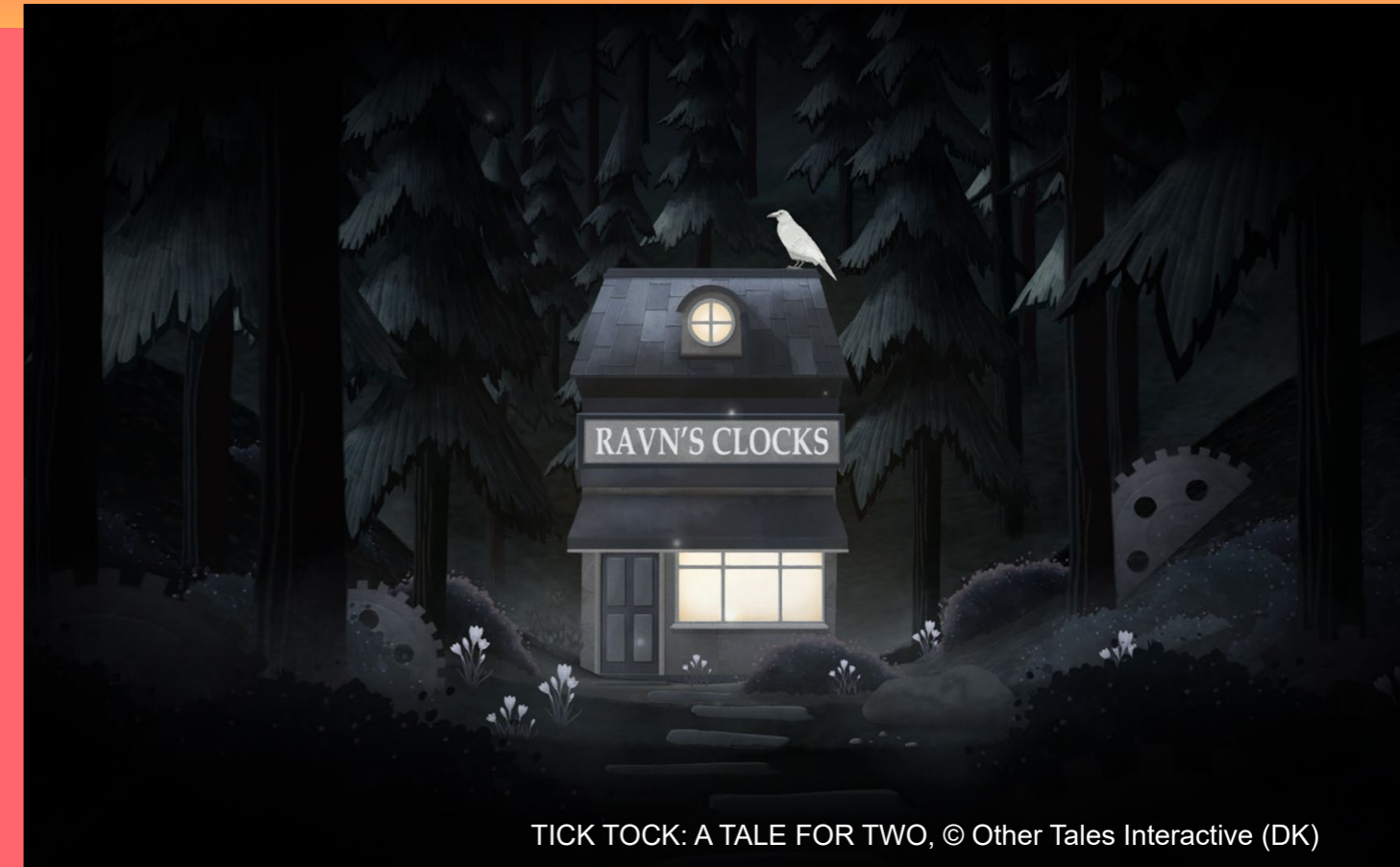
TICK TOCK: A TALE FOR TWO, © Other Tales Interactive (DK)

The Games Scheme has no fixed limit for the development, production and launch stages.